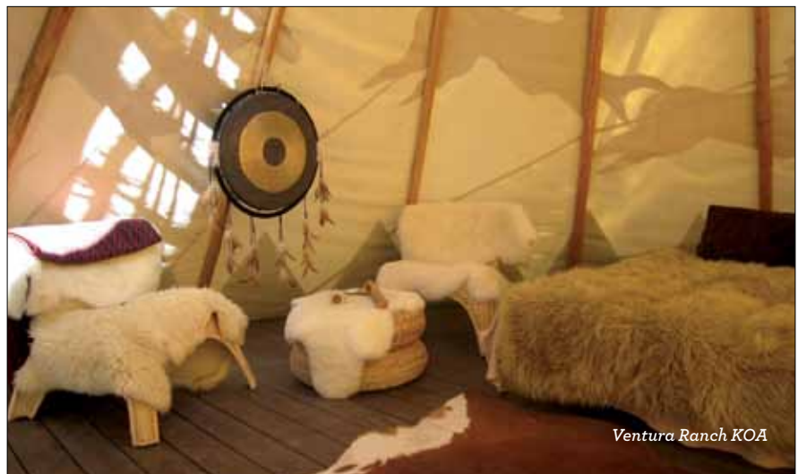
Ventura Ranch KOA

$169 – $299 per night | treebonesresort.com